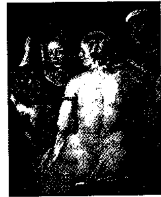
Venus at the Mirror by Rubens

Did You Know? Historically the word "cellulite" didn't exist until the late 1800's. Prior to that time, women gladly exhibited their dimply behinds in Victorian works of art, most famously represented in Renaissance Master and Flemish artist Peter Paul Rubens' paintings with his beautifully ample female subjects becoming known as "rubesque" was a sign of those of wealth and fine living. Ironically, now we spend billions of dollars each year trying to get rid of it.